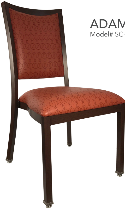
ADAMS II-SC Model# SC-036-C