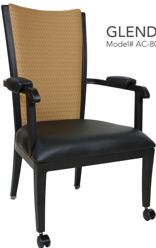
GLENDAN Model# AC-800