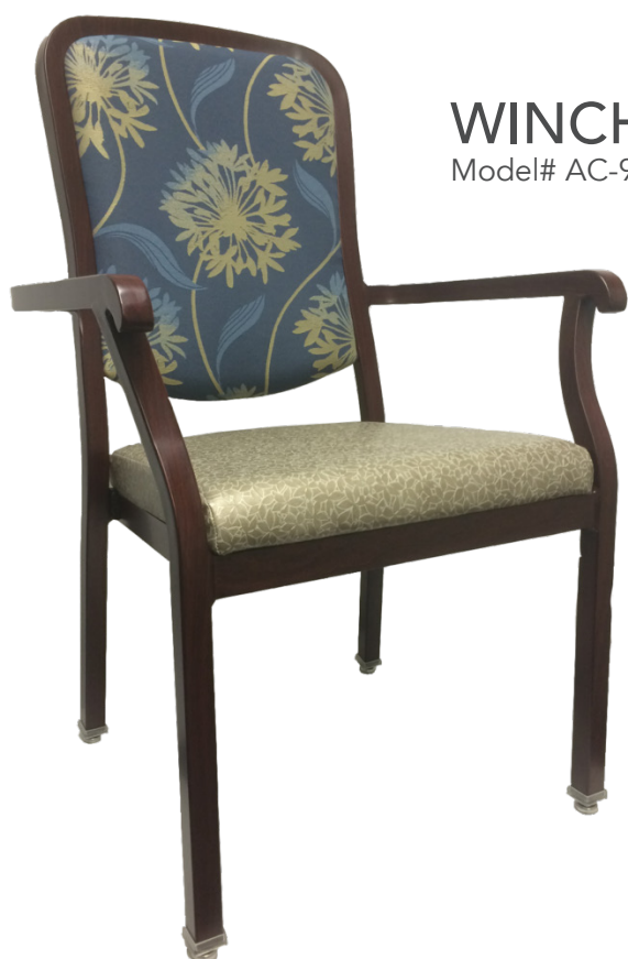
WINCHESTER Model# AC-950