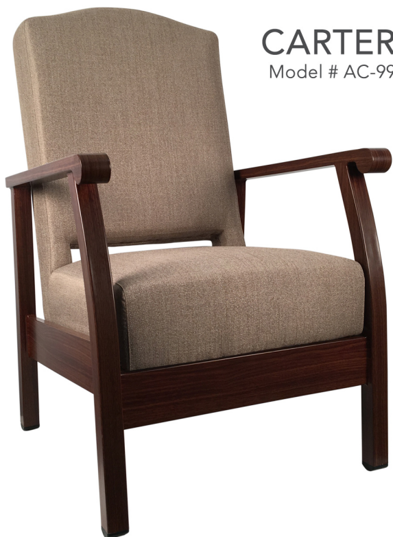
CARTER-B Model # AC-995-B