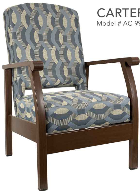
CARTER Model # AC-995