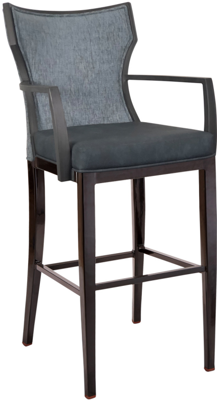
BRYANT Model # BS-417